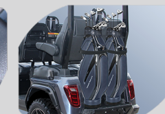
Optional Golf Bag Holder