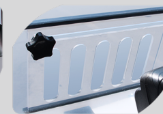
Slideable Air Vents