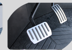
Accelerator / Brake Pedal