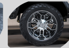
Tires For Off-road Models