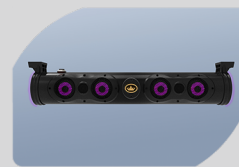
Cylindrical Evolution Sound Bar